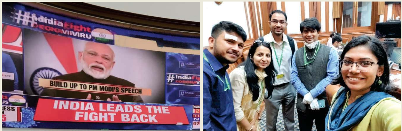
(Deployment of IFS OTs at COVID-19 Control Room, MEA, New Delhi)

Phase-II of ITP commenced on 15 June 2020 through webinar and is in progress.