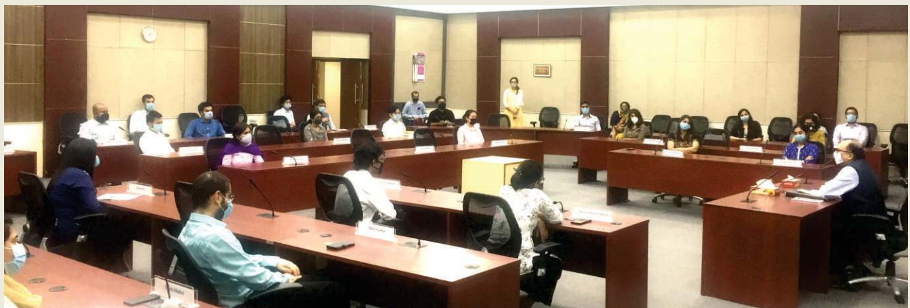
(Address by Dean (SSIFS) to IFS OTs in the Phase-II of ITP)