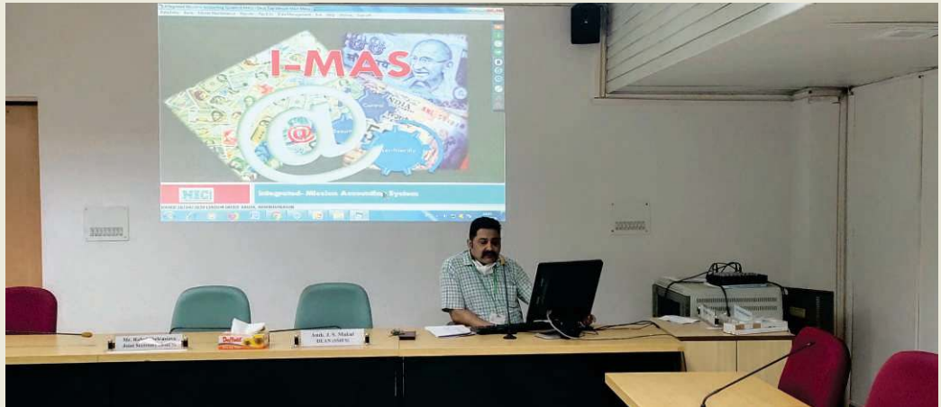
(Speaker addressing on webinar to participants of IMAS Training Programme)

A 1-day IVFRT (consular) training was conducted on 13 June through webinar. The training was attended by 51 participants.